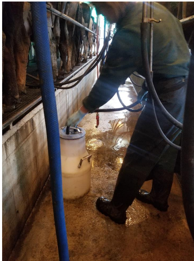
Figure 8: Siphoning off the colostrum or antibiotics-containing milk.

2015; Paxson, 2008) adding a microbial element to the enactment of industrial agriculture's 'control dream'(Singleton, 2010). Mastitis, for example, is a bacterial life form that threatens the vitality and economic viability of its host subject. Milk from the Kagan farm is tested with every tanker collection for the presence of somatic cells, which indicate infection. Yet the method by which this infection is controlled, using antibiotics, also poses a carry-on risk of further infection to cooperative dairy industry bodies themselves. Kathy's controlled partitioning of the milk from those cattle on antibiotics is a costly measure of control that must be done in order to abide by industry standards. The risk is in the process; milk from a single cow containing antibiotics is liable to be mixed into a vat containing milk from hundreds of other cows, from which it can't be extracted.