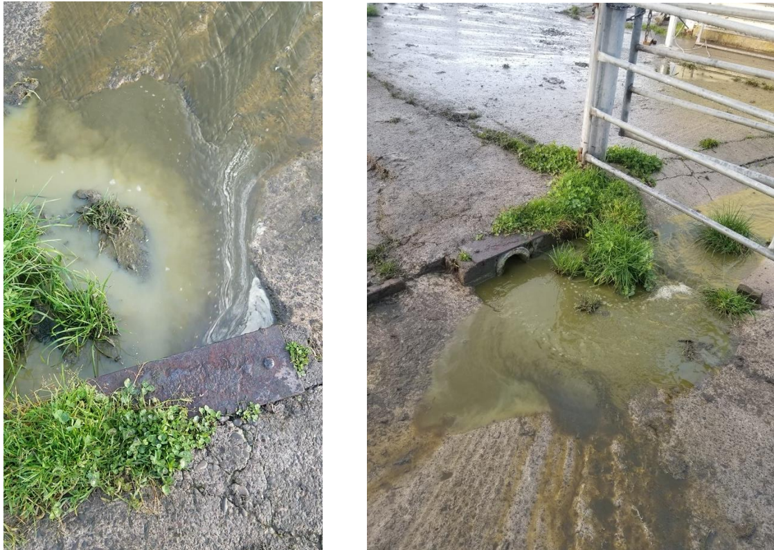
Figure 9: Effluent flowing into drains.

Effluent is a material that straddles multiple realities in its relations to farmers and the landscape. It contains water, spilt milk, detergent and soil carried by cattle bodies, and it is also rich in nitrogen, phosphorus, potassium, and sulphur. These properties can make it dangerous, but they can also be opportunistically harnessed and repurposed as a valuable resource through farmer-led application to pastures, or by direct deposit from cattle. The absorption of these minerals by in-soil microbes, fungi, and the ryegrass and clover plants contribute to plant growth and vitality. Through this process, the mineral components of the fecal matter are recaptured and applied in a manner that intensifies and mimics pre-industrial ecological systems of plant growth and nutrient cycles. This hyper-concentrated mimicry of organic ecological systems is essential to the rate at which biocapital is produced, particularly in New Zealand, due to the naturally low-phosphate in the soils.