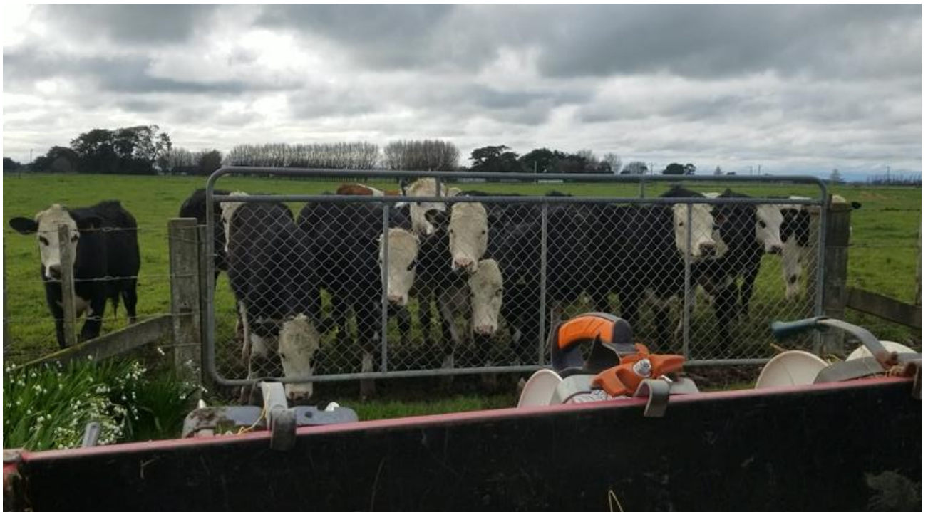
Figure 1: Graham and Ethne's Herefords.

I was immediately charmed by the group of yearling Herefords we encountered on Kathy's parents' farm. Bounding towards us as we approached their paddock, their excitement only increased when they heard the clicking sound that indicated an automatic fence opener was activated. They were kicking up their heels, surrounding our little vintage four-wheeler bike (affectionately known as 'the mule') as we drove into the paddock to scatter additional hay amongst them. I'd heard from Kathy that such behaviour is typical of youthful cattle like these, as well as dry stock who haven't been in the milking system for several weeks.