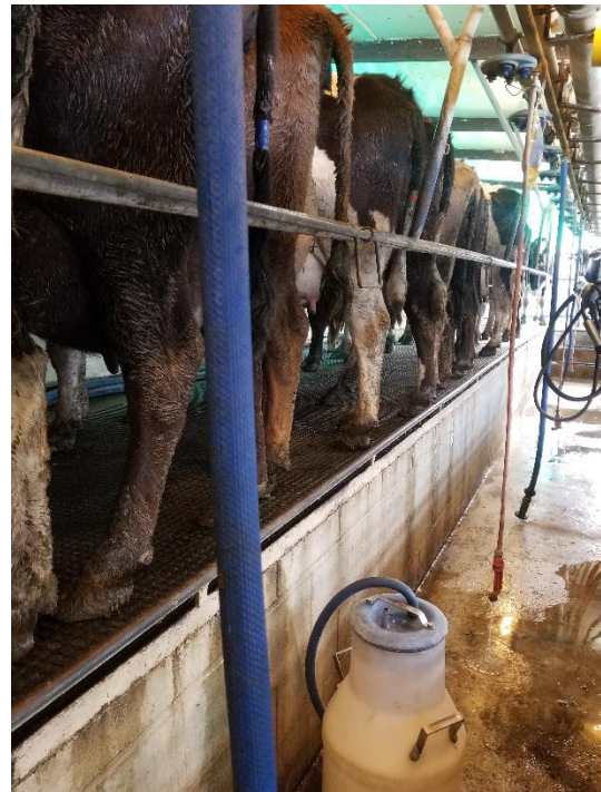
Figure 6: The two views of the cows in the milking shed.

The cattle entered to one side of the herring bone. Kathy was guiding them through remotely, using a chain from inside the pit that was connected to a moving part of the metal fencing outside where the herd had amassed.