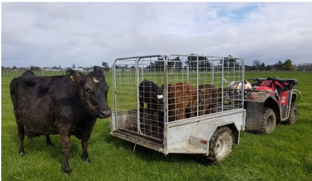
Figure 10: Collecting calves and mothers.

physical skills. Every experience was different; variables included the number of calves we picked up, the age of the calf (and its consequent ability to struggle, which increases dramatically over mere hours), the cleanliness of the calf, the temperament of the mother, and the weather. The general process, however, remained the same. We'd drive the quad bike, trailer attached, to a paddock where a cow (or several) had recently given birth. Then we'd use any of several available techniques, which are detailed later in the chapter, to get the calf into the open trailer. Kathy or I would spray its navel with iodine to help prevent infection, or 'navel rot', and use spray paint to mark an identifying number on its body. Kathy would record this number, along with the mother's identity, in her phone or a notebook. We'd close the trailer and bring the calf back to the calf pens. Usually, we'd bring the mother with us, to drop her off in the colostrum group that was kept in the northern paddocks, far away from the calves.