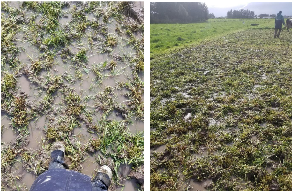
Figure 2: Paddocks following rain and cow hooves.