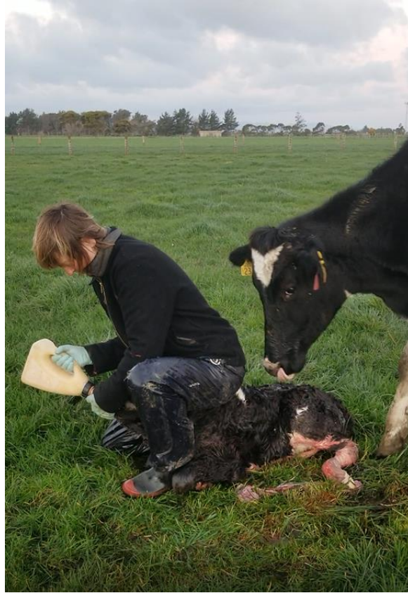
Figure 12: The third party farmer.

Management of farmer-led calf feeding demonstrates how nurturing practices initiate the incorporation of calf bodies into the biopolitical system of the farm (L. Holloway et al., 2012). The concentration of antibodies in colostrum milk naturally wanes over the days following birth, but farmers tend to continue feeding out colostrum to their calves for days following the natural end of the individual cow's colostrum generation, to provide additional gut immunity. Kathy and Logan stressed the importance of successful feeding as something that would impact the calves' growth rates and health over their whole life. This, too, is a point stressed by industry bodies like LIC and DairyNZ, the latter of which specifically advises that 'extra effort now will pay dividends throughout her milking life' (DairyNZ, 2015a). This rationale combines the investment logics of capitalism with the biopolitical strategies of life-optimisation. A very particular understanding of cattle wellbeing is propagated, acted upon, and considered synonymous to the economic livelihood of the farm. Yet this is achieved through intuitive and responsive practices of attentiveness and care.