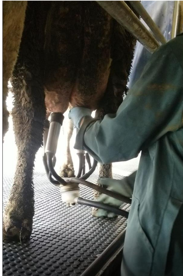
Figure 7: Applying suction cups.

Kathy pushed a button, initiating a whooshing sound of air releasing. She handed me a suction cup and told me to put my thumb inside. It fit neatly, the suction wasn't constant, but pulsating. She explained that the speed of the 'suck', and how hard it sucks, are designed to increase the speed of milk retrieval. But it's a balance; if it's too hard or fast, you can damage the cow's teats, and 'she won't have a positive experience'.