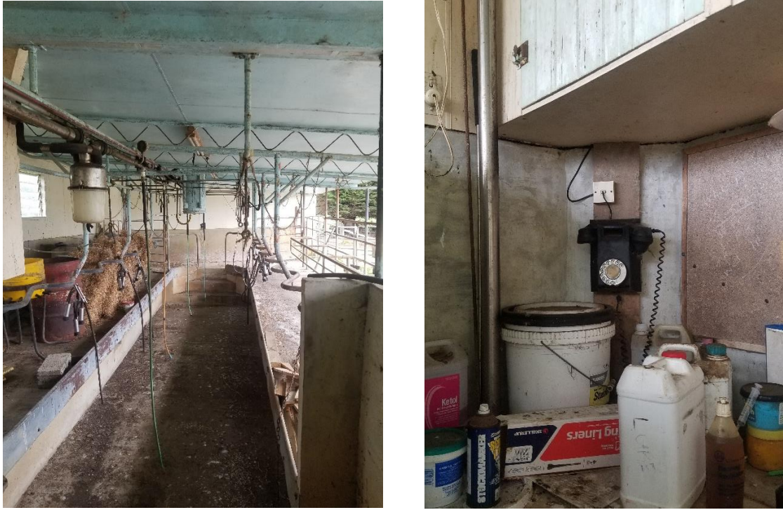
Figure 2: Graham's milking shed and the single-line telephone.

The old phone and the dairy shed that lingered years after their practical use were just some of many material indexes of a generation of human life here. Logan was also keen to tell me about the tripod-style cylindrical storage tanks on the driveway near the house. They had been painted a lemony-beige colour, but rust had long been getting at the edges in this exposed environment. While once commonplace on farms, construction of such tanks hasn't been permitted since 1996, due a history of structural issues. Effort has since been put towards decommissioning the remaining tripod tankers as they have continued to pose a health and environmental risk following several reported incidences of collapse. Logan had to grapple with other forms of antiquated or dysfunctional technology all day, sharing a single battery, for example, between the two tractors he was using to dispense bailage.