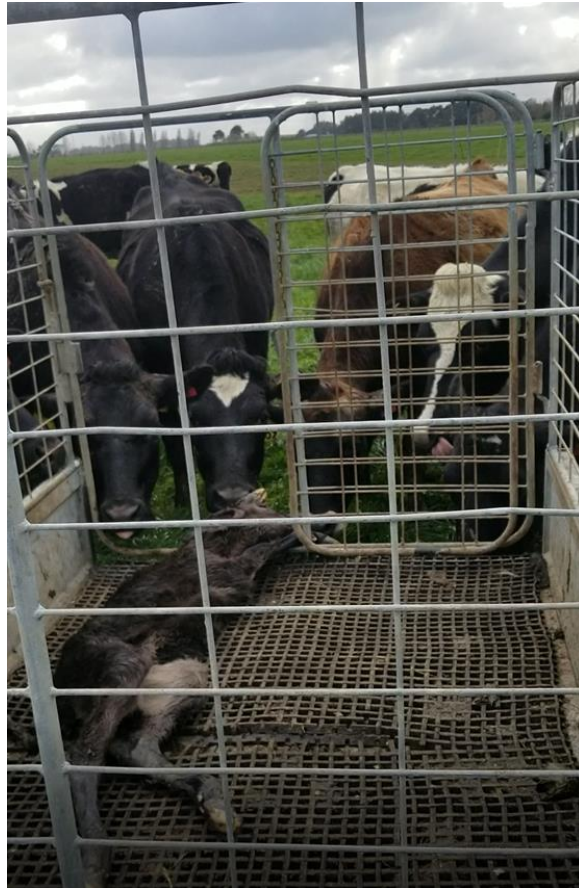
Figure 14: A group of 'aunties' crowd around the dead calf.