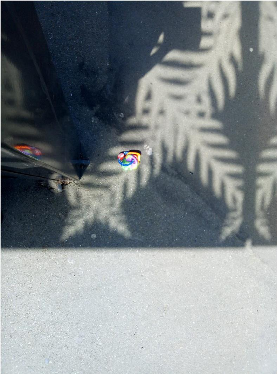
Visual response 2: Jen Margaret - Photograph 4: 'The land we walk'