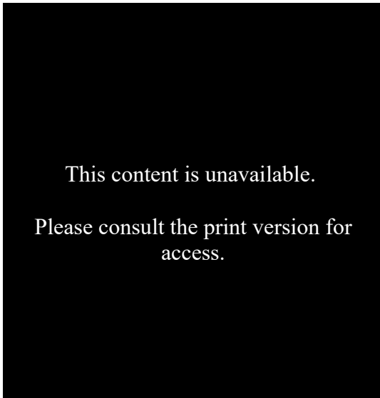
Figure 1: Gold aureus of Constantine I, with moustache. Siscia RIC VI 152