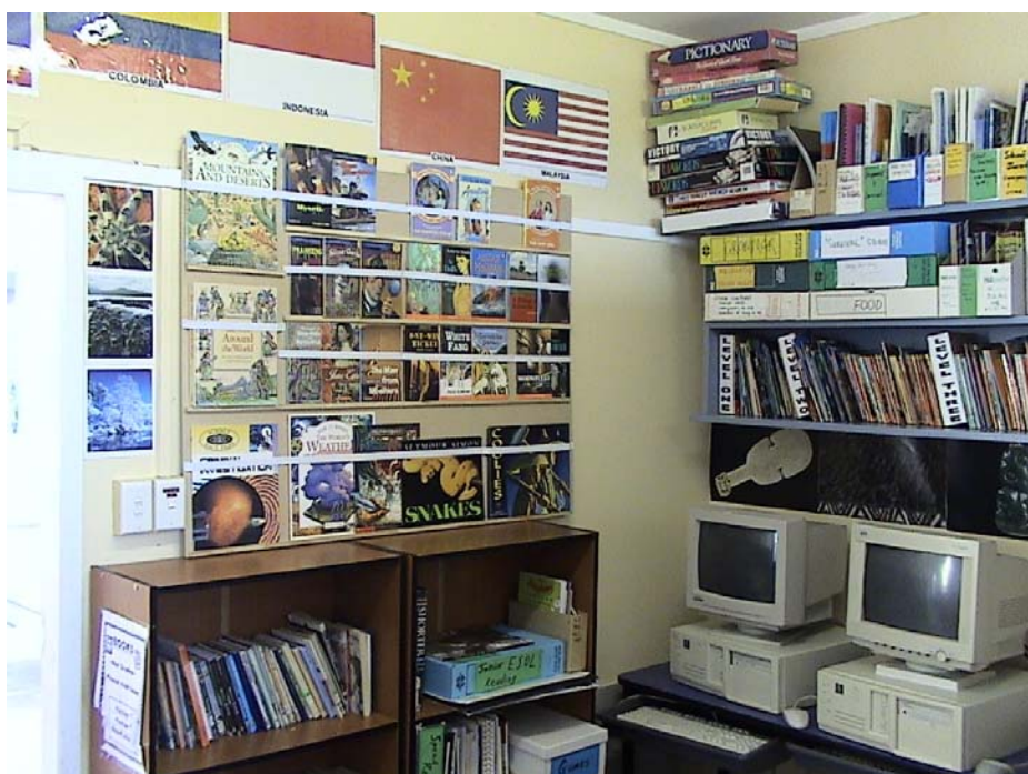
Fig. 2. Extensive Reading Library Display and Room.