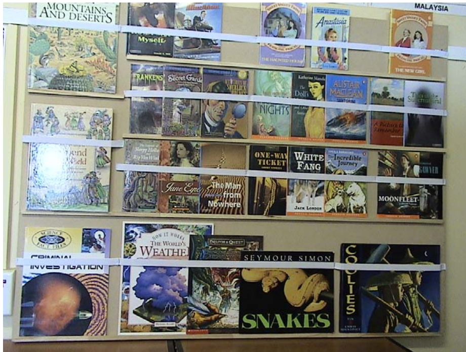
Fig. 1. Extensive Reading Library Display.

the beginning of the year) with their covers facing outward, and was as large as I could make it given the very restricted space available in the classroom. During the year I rotated the texts, and incorporated more texts as the year progressed so that new books were always on display.