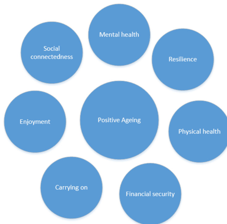
Figure 2: Participants' definitions of positive ageing.

Through discussions of personal meanings of positive ageing, a multi-faceted view of the concept emerged. These characteristics of positive ageing do include some strong similarities to the New Zealand Government's Positive Ageing Strategy, although there are points where the personal definitions and the official Positive Ageing Goals of the New Zealand Government diverge (refer to Figure 1 for the Positive Ageing Goals).