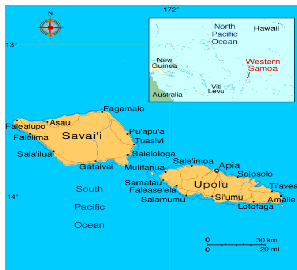
Figure 1. Map of Samoa: From Magellan Geographix www.maps.com ).

located 2,600 miles southeast of Hawaii, 1,800 miles northeast of New Zealand, and 2,700 miles east of Sydney, Australia.