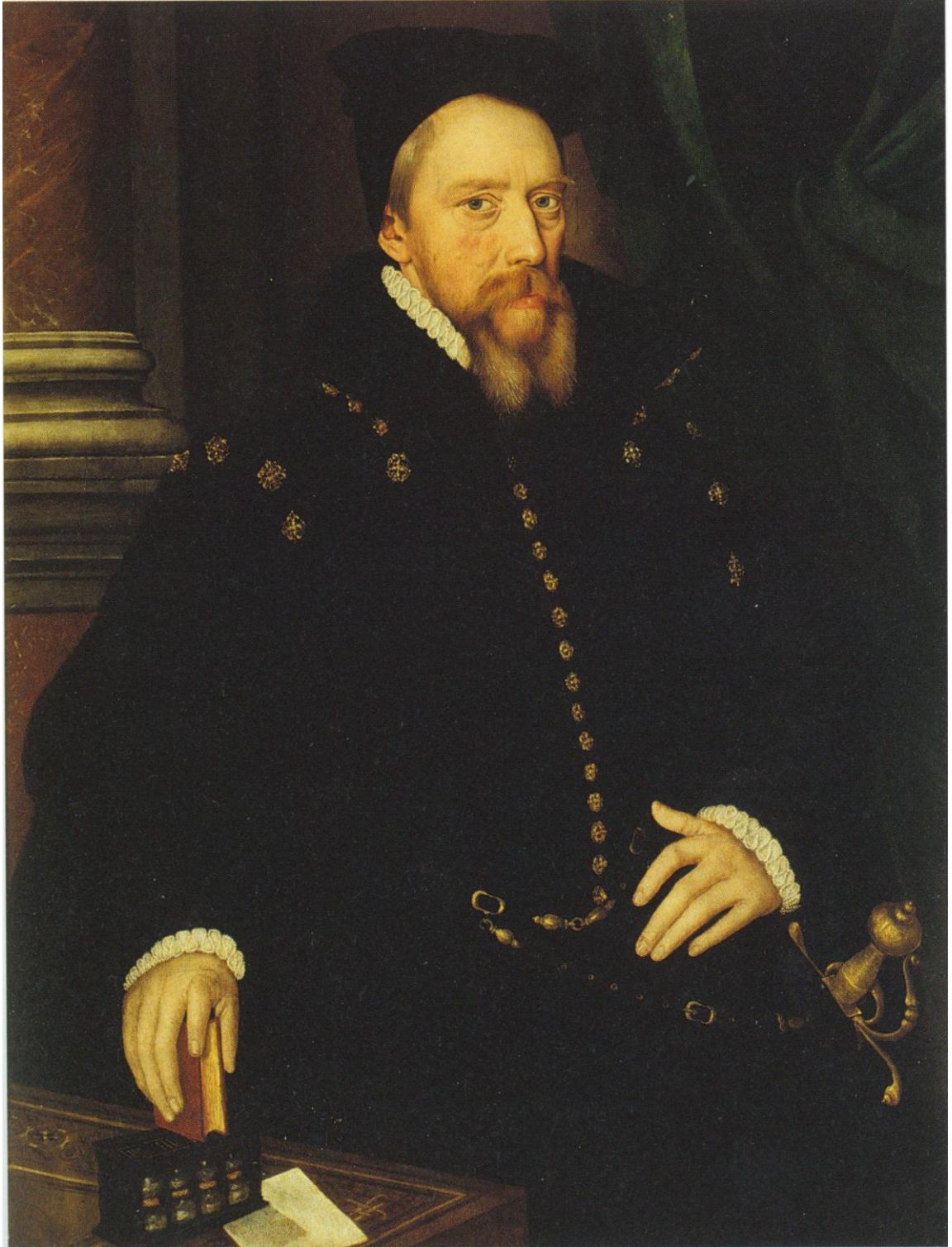
Image 1: Attr. Hans Eworth, 'William Cecil, Lord Burghley', c.1565